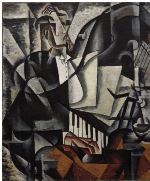
“The Pianist” Liubov Popova, 1915

Festival for Creative Pianists, P.O. Box 1254, Montpelier, VT 05601 www.festivalforcreativepianists.org