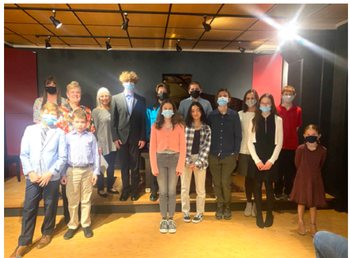
DAMTA's student musicale program helps create community in the Denver area.