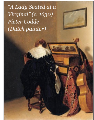
“A Lady Seated at a Virginal” (c. 1630) Pieter Codde (Dutch painter)

From the virginal , an instrument intended to occupy young women of the 16th and 17th centuries, thereby keeping them, well...eponymous, to the rise of the virtuosa : an epoch-spanning journey of passion, courage, resolve, and dazzling talent.