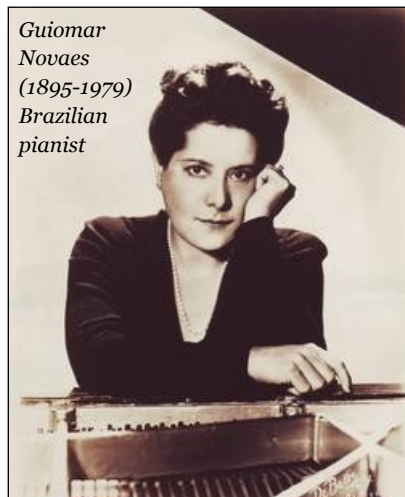
Guiomar Novaes (1895-1979) Brazilian pianist