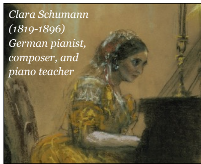
Clara Schumann (1819-1896) German pianist, composer, and piano teacher