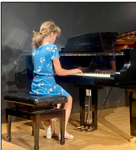
A student performing at a student musicale at Classic Pianos