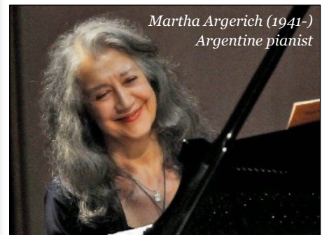
Martha Argerich (1941-) Argentine pianist