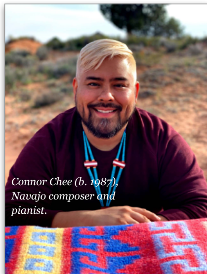
Connor Chee (b. 1987), Navajo composer and pianist.