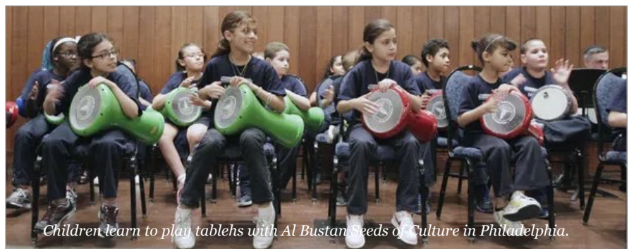
Children learn to play tablehs with Al Bustan Seeds of Culture in Philadelphia.