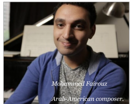
Mohammed Fairouz Arab-American composer.