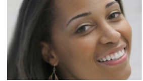
DEI: BEING THE CHANGE DAMTA RECOGNIZED