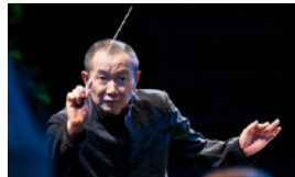
ASIAN-AM. & PACIFIC ISLANDER HERITAGE A CELEBRATION