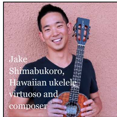
Jake Shimabukoro, Hawaiian ukelele virtuoso and composer