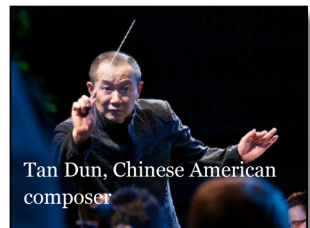
Tan Dun, Chinese American composer