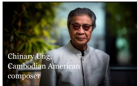
Chinary Ung, Cambodian American composer