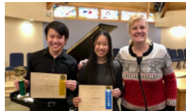
THE BROOMFIELD PIANO FESTIVAL A MUSICAL SATURDAY