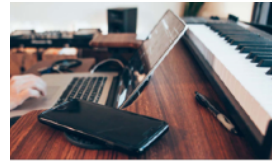
DAMTA FALL COURSE ENGAGING WITH TECHNOLOGY