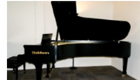
STUDENT MUSICALES OCTOBER 11