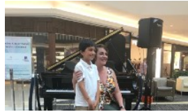
SPOOKATHON 2020 OCTOBER 25