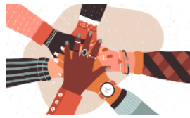
MISSION STATEMENT DEI COMMITTEE NEWS